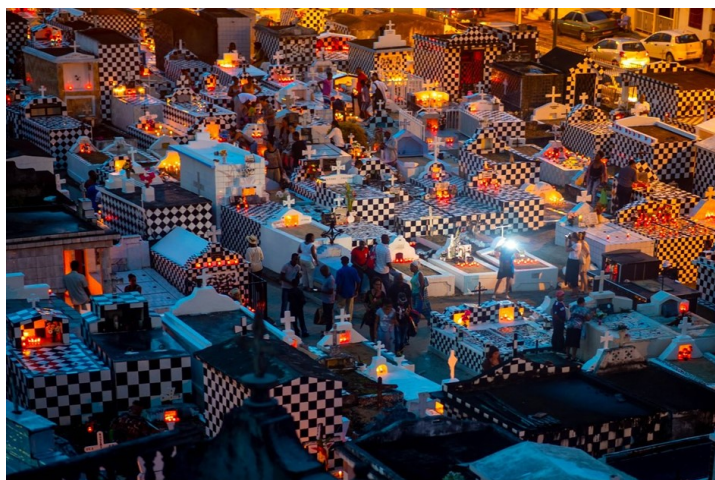
La Toussaint in Guadeloupe

Last week our French linguists got the opportunity to do some cultural starters on La Toussaint (All Saints' Day) and Diwali, two religious celebrations widely commemorated in the French-speaking world.