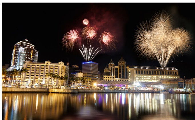
Diwali celebration on the island of Mauritius