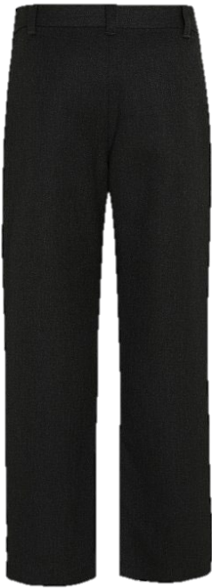
Charcoal grey trousers