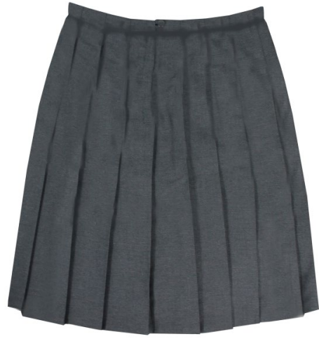
Charcoal grey fully pleated skirt (knee length)